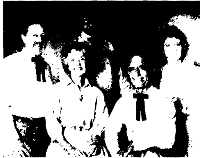
The Chuck Wagon Gang

Buy your ticket in advance and have your seat reserved by number Tickets sold at door unreserved SNACK BAR OPEN