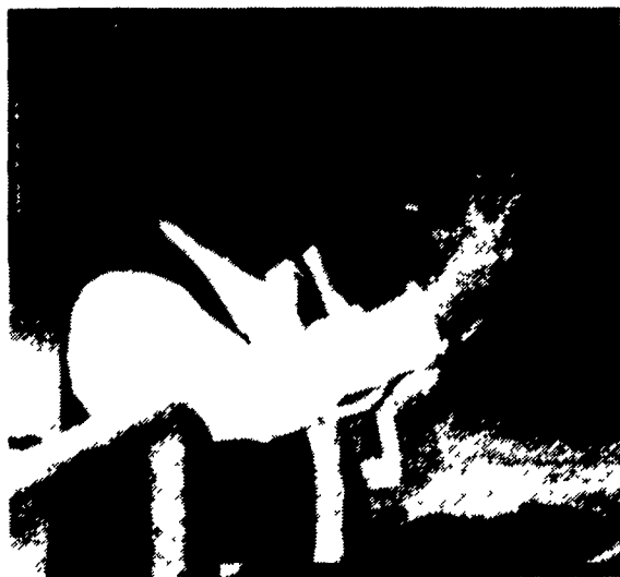
Only 35. That's right...35. Only 35...thousand.