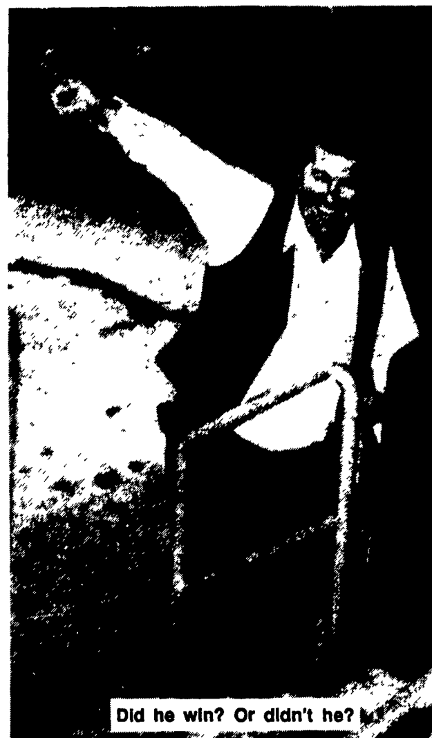
Did he win? Or didn't he?