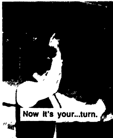
Now it's your...turn.