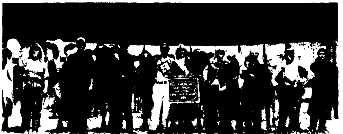
Maryland exhibitors joined together to capture the First State Herd banner of the Eastern National Holstein Show held in Harrisburg last week as part of the 26th Pennsylvania All-American Dairy Show.