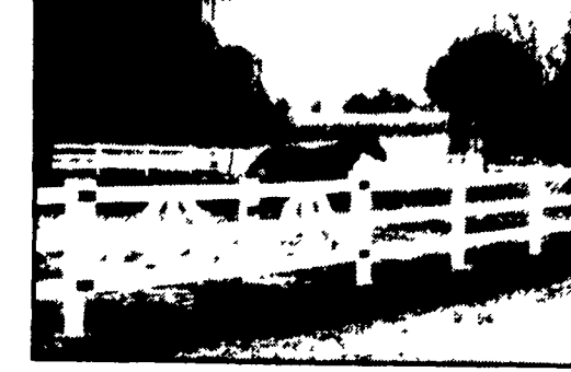
"Vinyl Horse Fence"