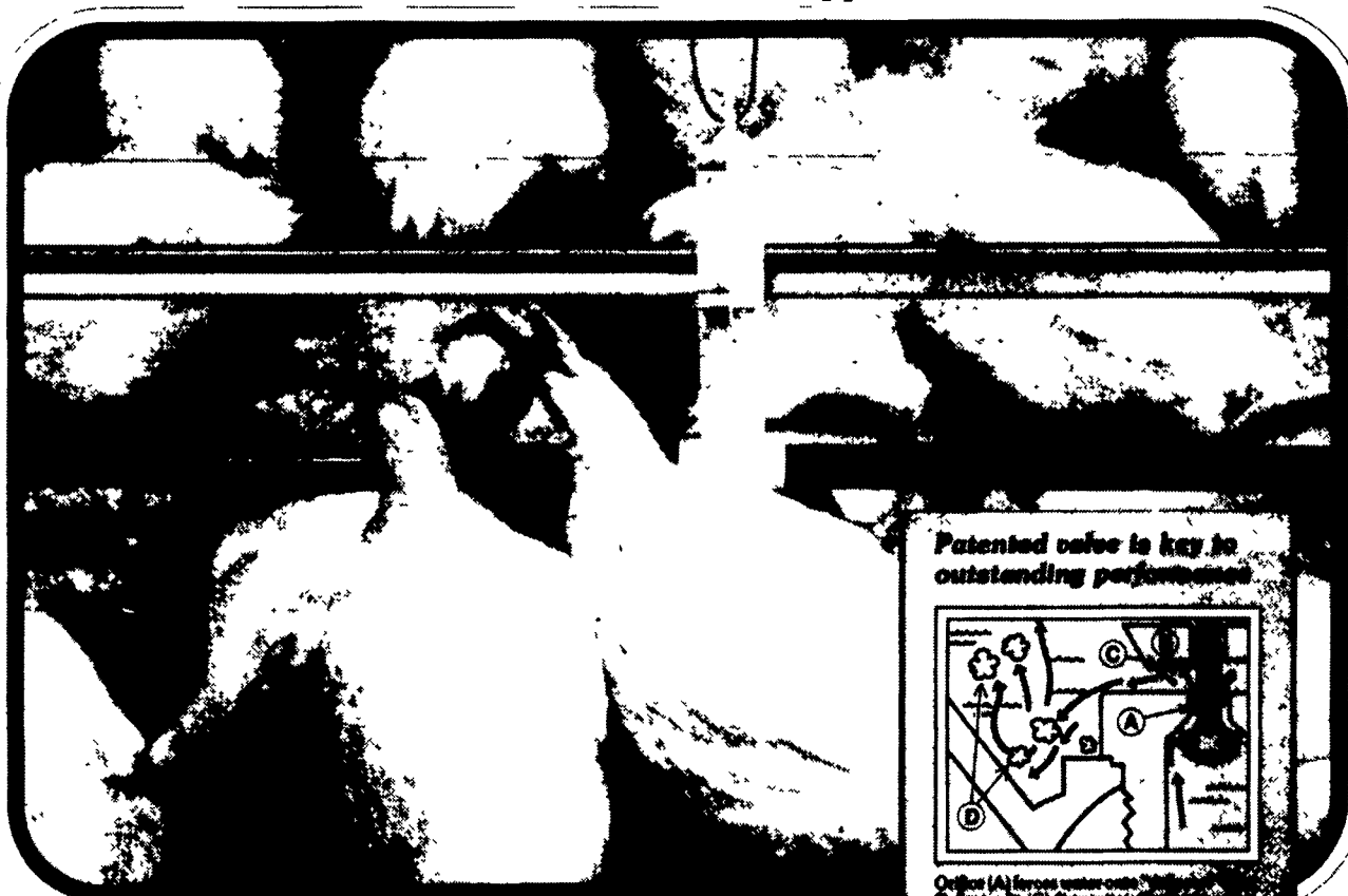
Patented valve is key to outstanding performance