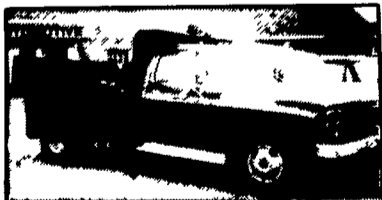
'79 C-30 CHEVY DUMP 454, AT, PS, PB, AC, 40K $9,495