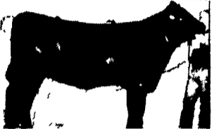
CONGRATULATIONS FOX HILL

FAIRFIELD MARIANNE This top selling heifer calf of Cow Power XVI was recently chosen Reserve Early Spring Heifer Calf Champion of the 1989 Atlantic National ROV.