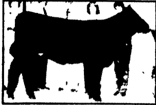
FROM DAWN ACRES AND HUNTINGDON FARMS

H F DUCHESS 451 A part All-American Reserve Grand Champion who was Grand Champion of the National Junior Angus Show. An embryo by Dan Patch sells plus a tremendous 2-year-old daughter by Shocker who is a flush sister to the All-American champion H F Jolt.