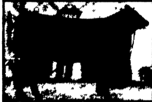
FROM WHITESTONE AND T&J

H F NEW QUEEN 577 Senior Heifer Calf Champion of the Virginia Breeders' Show and a powerful All-American whose dam was Reserve Grand Champion of the Pennsylvania Breeders' Show. This tremendous daughter of New Yorker sells bred to MacKenzie.