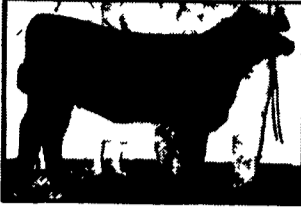
FROM FOX HILL FARM

FOX HILL NEW BLACKCAP T53 Senior Heifer Calf Champion of the Keystone International and the Pennsylvania Farm Show. She was Reserve Senior Heifer Calf Champion of the Eastern National. From the family that produced Sayre Patriot, she sells bred to F F Star-truck with a February show heifer prospect at side by B&L Jeweler.