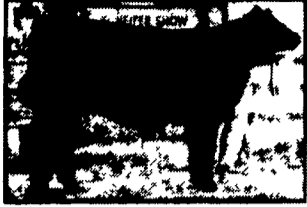
FROM DAWN ACRES ANGUS

PREMIER ASHLEY Grand Champion of the North American International Junior Show and the Maryland State Fair, Supreme Champion of the Eastern National. One of the breed's great young cows, she sells with a July natural calf at side by Taurus. One-half interest and full possession sells.