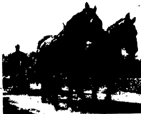
"Molly" and "Doll" - A pair of 9 yr. old Percheron mares, well broken. Horse equipment, etc.

LOCATED AT ST. LUKE, VA., ON RT. 605, APPROX. 5 MILES WEST OF WOODSTOCK, VA. 181, EXIT 72, WEST ON RT. 42, TURN RIGHT ON RT. 605, MIDWAY BETWEEN WINCHESTER AND HARRISONBURG - SHENANDOAH COUNTY.