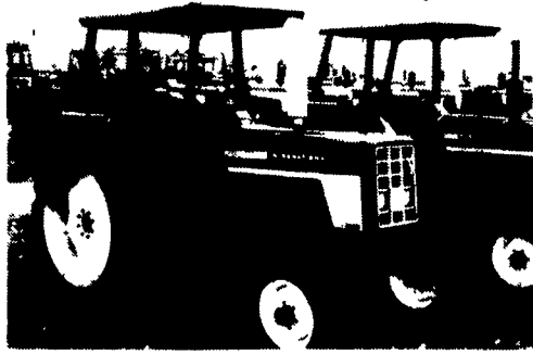
IH 574 Diesel, PTO, 3 Pt. Canopy, Fresh Paint.