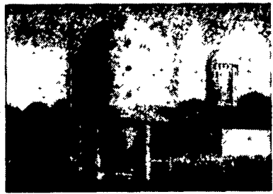
"Brite" When Activated - Dark When Off