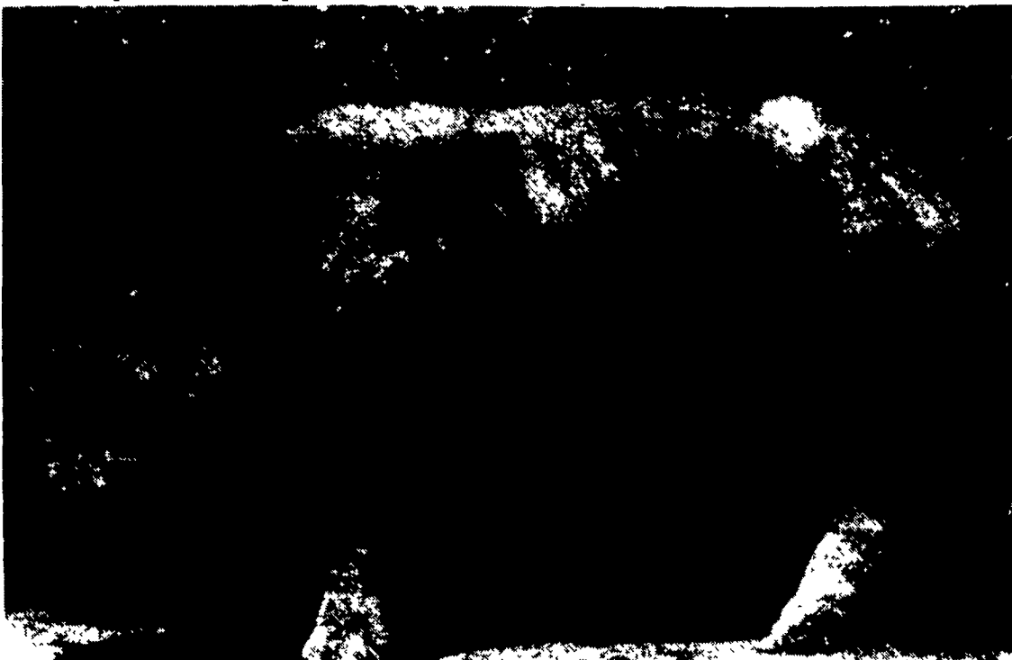
This mature Melshan sow is one of the pigs DeKalb Swine Breeders has imported from China for genetics research.

"The Caulks have impressed me with the priority they assign to safety," Jester says. "They put safety into practice."