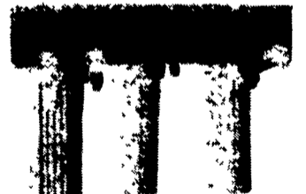
8. DELUXE WASHER