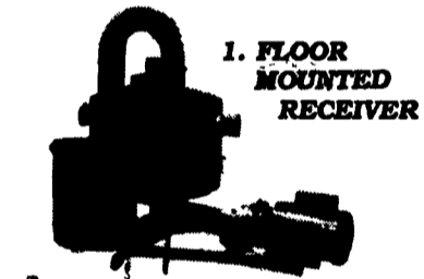
1. FLOOR MOUNTED RECEIVER

See Us At AG PROGRESS DAYS For All Of Your Fall Needs