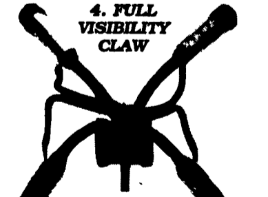
4. FULL VISIBILITY CLAW