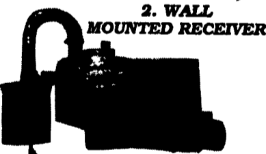
2. WALL MOUNTED RECEIVER