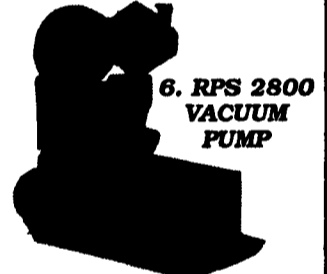
6. RPS 2800 VACUUM PUMP

RAPID EXIT MILKING PARLOR STALLS- Hear About It At Ag Progress Or Call For Details