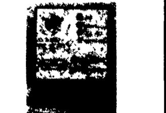
9. ECONOMY WASHER