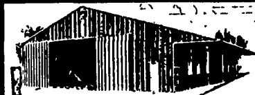
Customized (Many Options Available)