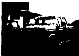
'86 Ford F350 Crew Cab, 6.9 Diesel, AT, PS, PB, AM/FM Cass., Cruise, Air, Tilt, Running Boards, 21,000 Miles, Exc. Cond. $12,500