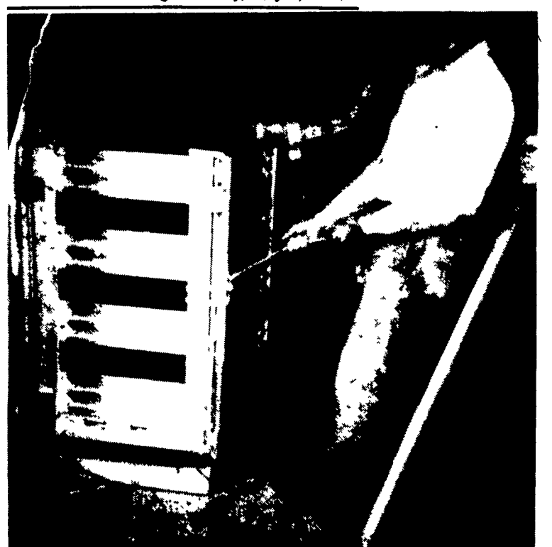
This aluminum livestock scale fits into any cattle chute and can weigh animals up to 4,000 pounds.