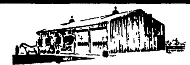
Barns - Riding Areas With or Without Stalls

We've Got The Solution - The Hottest Buildings At The Lowest Costs!