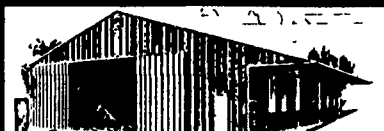
Customized (Many Options Available)