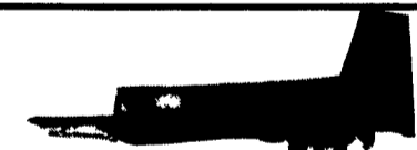
4'x8' Utility Trailers 1500 lb. G.V.W. 8" Tires