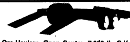
Car Haulers, Open Center, 7,000 lb. G.V.W. Available in 14', 16' And 18' Lengths