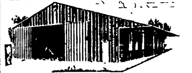
Customized (Many Options Available)