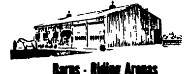
Barns - Riding Areas With or Without Stalls

We've Got The Solution - The Hottest Buildings At The Lowest Cost!