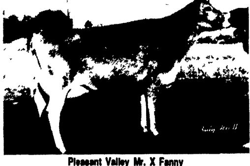
She sells. Fancy 3 Yr. Old Mr. X daughter due in August to Highland Magic Duncan. Dam Has 5.5%

Shippensburg Fairground, Shippensburg, PA (Located 3 miles from I-81 to S. Fayette Street.)