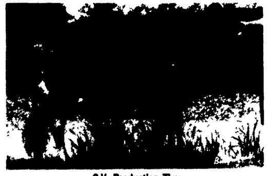
S.V. Production Tiny Tiny has 4 records over 5.9% bf and 4.1% protein. Her daughter by Romeo C sells. Last lactation tested

This sale emphasizes high solids milk with the right kind of type. 50 head of Registered cows springers and fancy calves will sell. Check these high testing consignments: