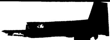
4'x8' Utility Trailers 1500 lb. G.V.W. 8" Tires