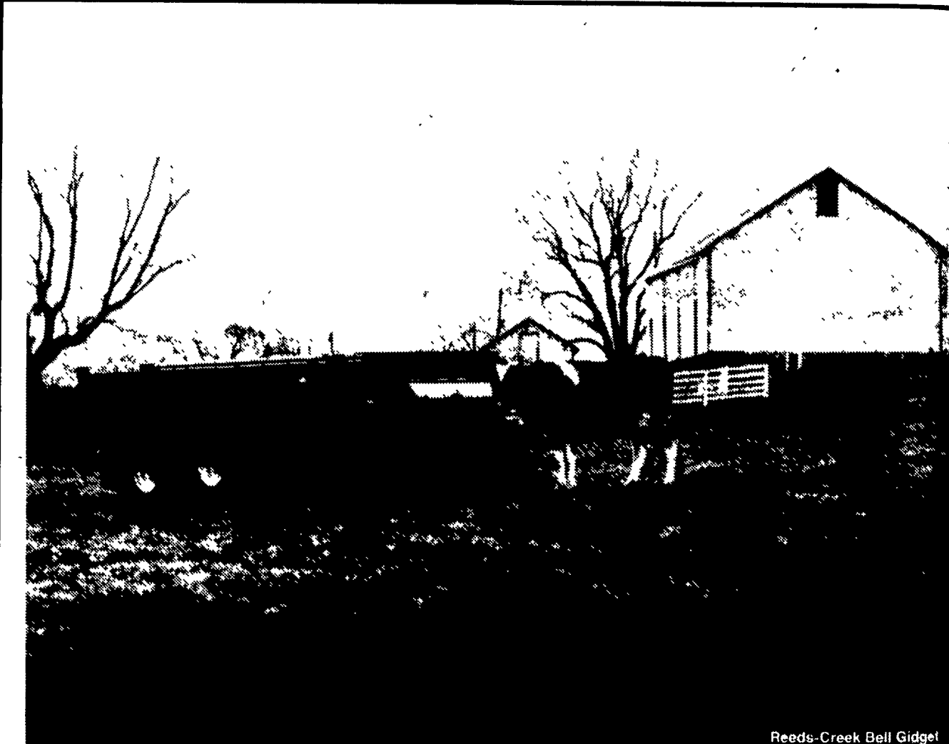
Reeds-Creek Bell Gidget