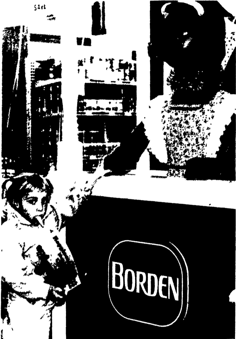
This little girl had a hard time deciding whether she enjoyed Elsie the cow or Elsie's ice cream better.