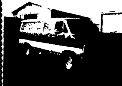
1988 Chev G20, 8 Pass., 6.2 diesel, AT, PS, PB, AC, PW, PL, Cruise, Privacy Glass, Towing Package, 21,000 miles.