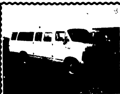
1987 Dodge B350 15 Pass., 360, V8, AT, PS, PB, AC, Dual, Cruise.

Wanted 26 or 28 foot roll- back truck bed in good con- dition. 717-733-7274, Lanc. Co.