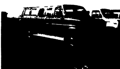
1987 Ford E350 XL 15 Pass., 351, V8, AT, PS, PB, AC, Dual Cruise, Tilt, Dual Tanks, 40,000 Miles, Xtra Clean.