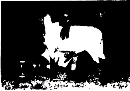
Champion Kutztown Fair

"The Only Sale by the Youth for the Youth"