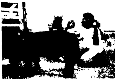
Champion, York County Roundup