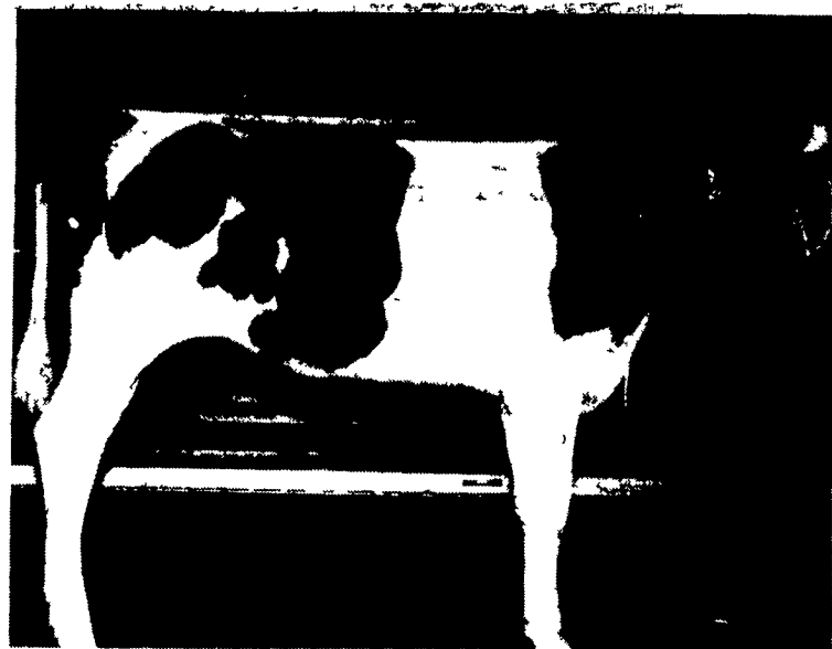
Selling for $18,500 was Plushanski B-Troy Forte-ET, an offering of Plushanski Farms Inc., of Kutztown. This January heifer calf was purchased by the Forte Syndicate of Imler.