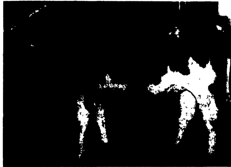
Topping the Supreme Creations Calf Sale was C Romandale Astro Lara-ET, which was purchased by Poverty Hollow Farms of Conu, New York for $26,000. She was consigned by Woodbine Farms of Airville.

Going for a price of $18,500 was Plushanski B-Troy Forte-ET, a January, 1989, heifer calf consigned by Plushanski Farms, Inc. of Kutztown. Purchased by the Forte Syndicate of Imler, she is sired by Ripvalley NA Bell Troy-ET, a Very Good, 88 pt. The paternal grandsire is Carlin-M Ivanhoe Bell, a Gold Medal