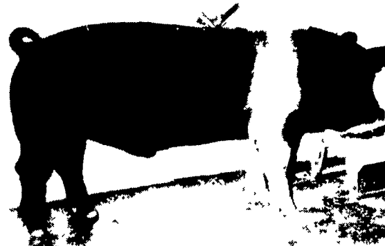
Keystone Res. Grand