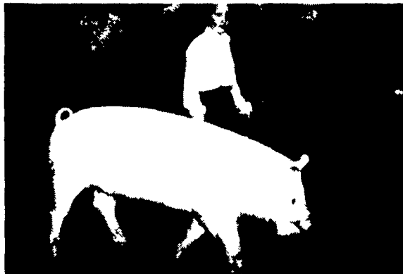
'88 PA Farm Show

Sow productivity is measured by number farrowed, and weaned and 21 day weight. Individual sow & litter performance records are made available. All litters are weighed. Open gilts available on order.