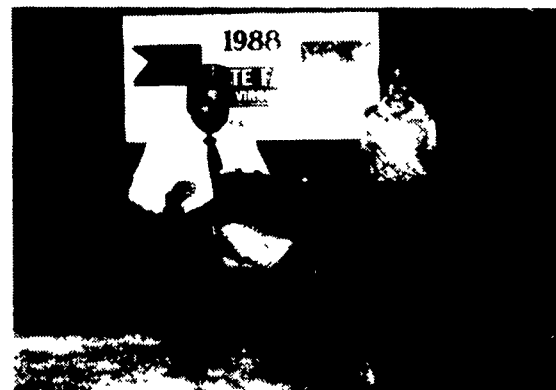
Virginia State Fair