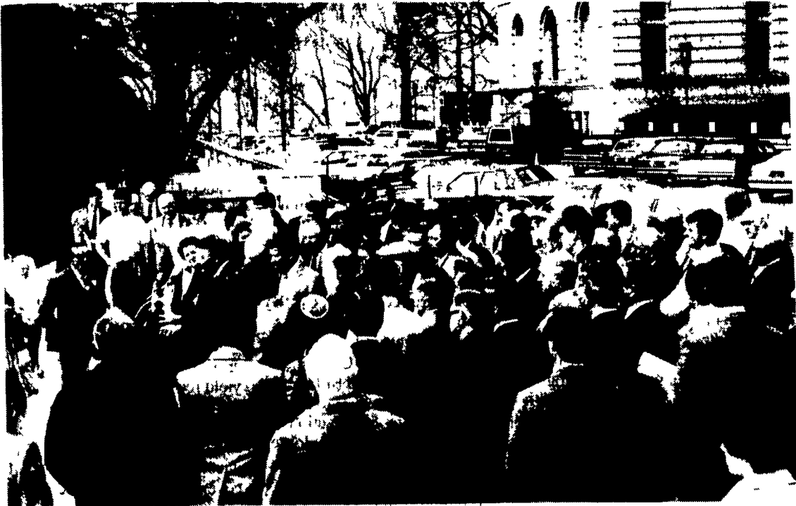
PFA members in Harrisburg.

PFA held the new conference in conjunction with their annual legislative tour to the state capitol.