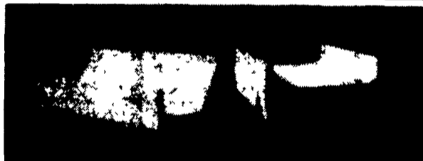
SLANT BACK J BUNK H-BUNK

Let Us Know Your Needs. We Can Deliver From Our Large Inventory And Set On Your Prepared Site. OR: We Can Load On Your Truck To Help Save On Freight Costs. We Have Several Sizes And Styles To Choose From, Plus Metal Posts, For Cable, Which Can Be Bolted To The Bunk To Keep Cattle Out.