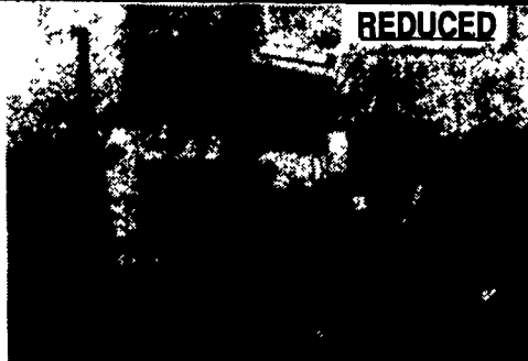
1975 Steiger Bearcat II- 20.8x34 Rubber- 3 Pt.- 4 Wheel Drive- Duals Included In Price Of $16,500