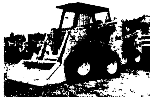
1979 & 1980 Case 1845 Skid Steer Good Condition- Diesels Choose From 2- $8,900