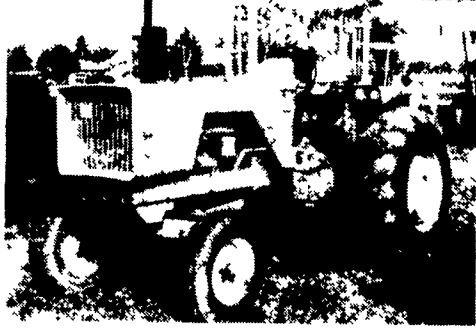
1967 AC 180 Diesel- Runs Good $4,900

HOURS: MON-FRI 7:30 To 5:00 SAT 7:30 To NOON