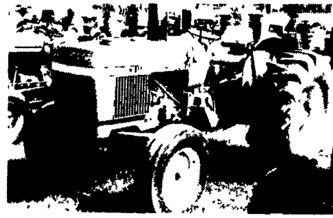
JD 2040 Diesel- 1980, Remote, Tiger Stripe Needs Hyd. Work $6,900