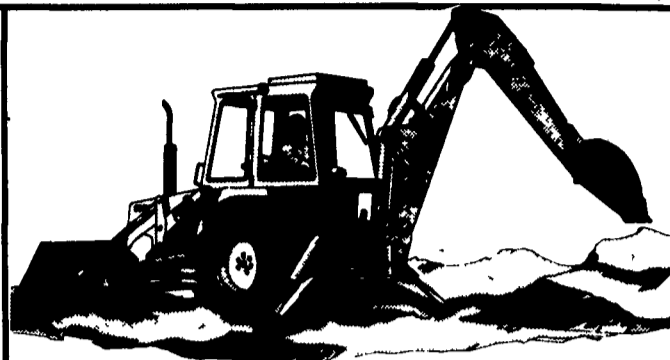
FORD 655A BACKHOE-LOADER

Stop in and see all the new Ford compact diesels. They're built to fit landscapers.