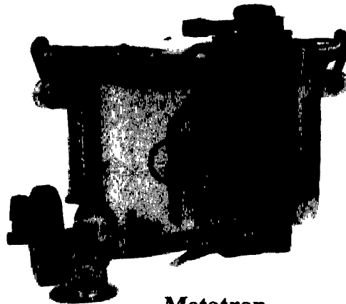
Metatron Milk Meter

Westfalia's Metatron gives you the edge in effective, economical herd management. This DHIA and USDA approved cowside milk meter provides milk metering on an individual cow milking for in-parlor evaluation. Vital information of milk produced, maximum milk flow, average milk flow and milking time is also available at cowside. Aids you to better manage each individual cow.