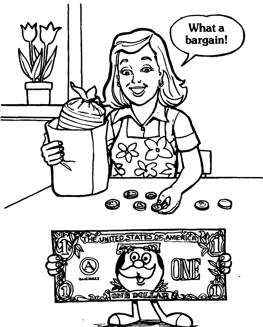
Reliable American farmers are such skillful workers that food costs most American families only about 14 cents out of each dollar they earn.