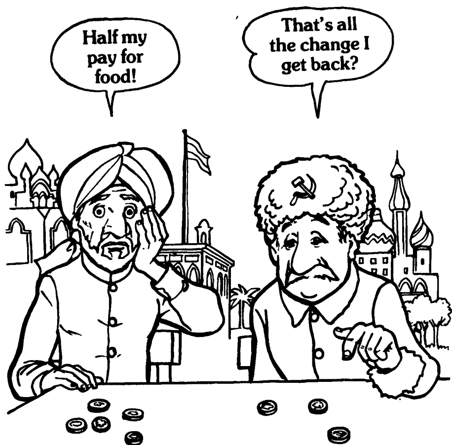
In other nations, people must spend much more on the money they earn to buy food. The people in India, China, Phillipines, and Niger, need to spend more than half their money on food.