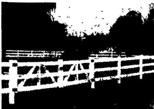
"Vinyl Horse Fence"