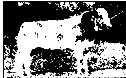
COURAGE, A BELGIAN BLUE BULL

Low Fat, Low Cholesterol, Good Taste Excellent for Crosses to Beef or Dairy Cattle Selected for Calving Ease, High Yield