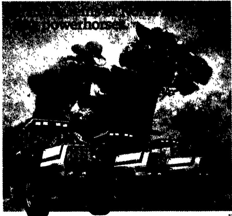
The New Deutz-Allis 9100 Tractors.