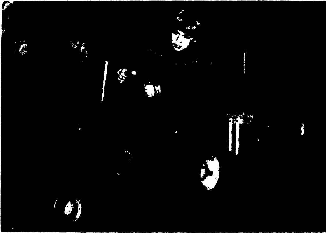
Tractor driving is no easy chore when you're hauling a hundred pounds on the sled.

He thought he probably won because, "I lift weights at my cousin's house."