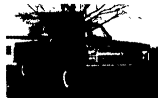
'87 Chevy Scottsdale 4x4, 1/2 Ton, Heavy Duty, AT, PS, PB, Air, 350 Engine, Cloth Seat, Gray, Excellent Condition, 11,000 Miles.