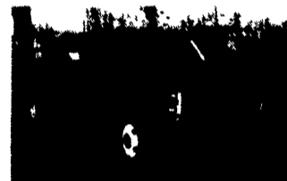
'87 Chevy 4x4 Silverado Crew Cab, Dual Wheel, AT, PS, PB, AM/FM Cass., Cloth Seats, 454 Eng., 30,000 Miles, Exc. Cond.