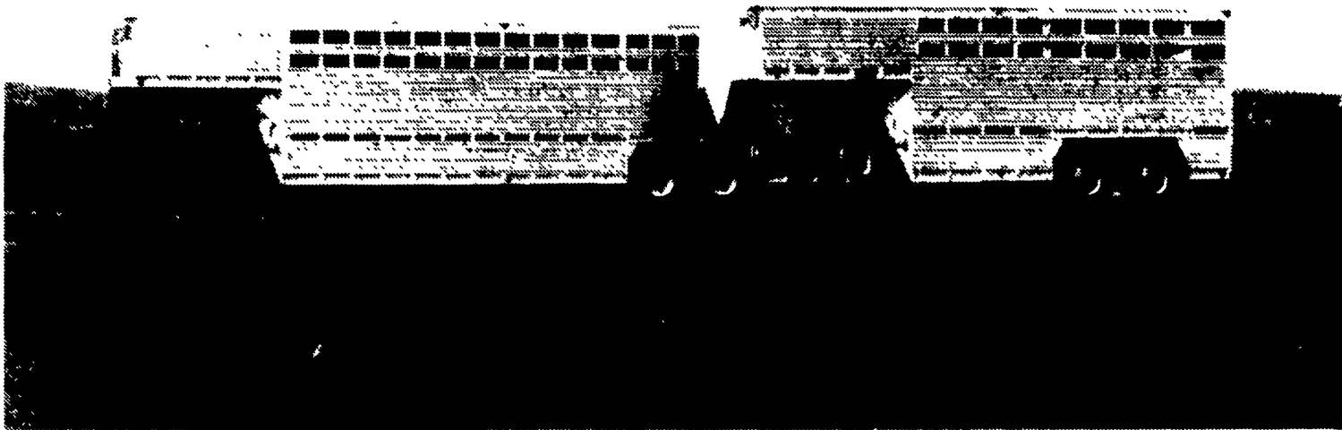
24 foot Ruff Neck trailer on left is Eby's workhorse. Trailer on the right is an economical, 16 foot Wrangler.