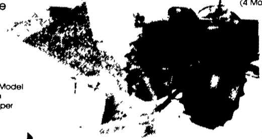
PTO Model Brush Chipper