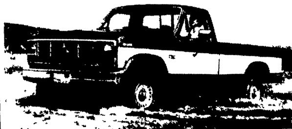
4 WD Pickups In Stock

Tempo - Cougar - Continental - Town Car - 4x4 - Box Van - Rangers -