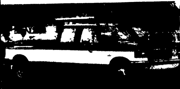
1988-Ford Crew Cab

Brand New Super Duty and Crew Cabs In Stock