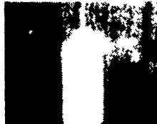
3 QT. BOTTLE