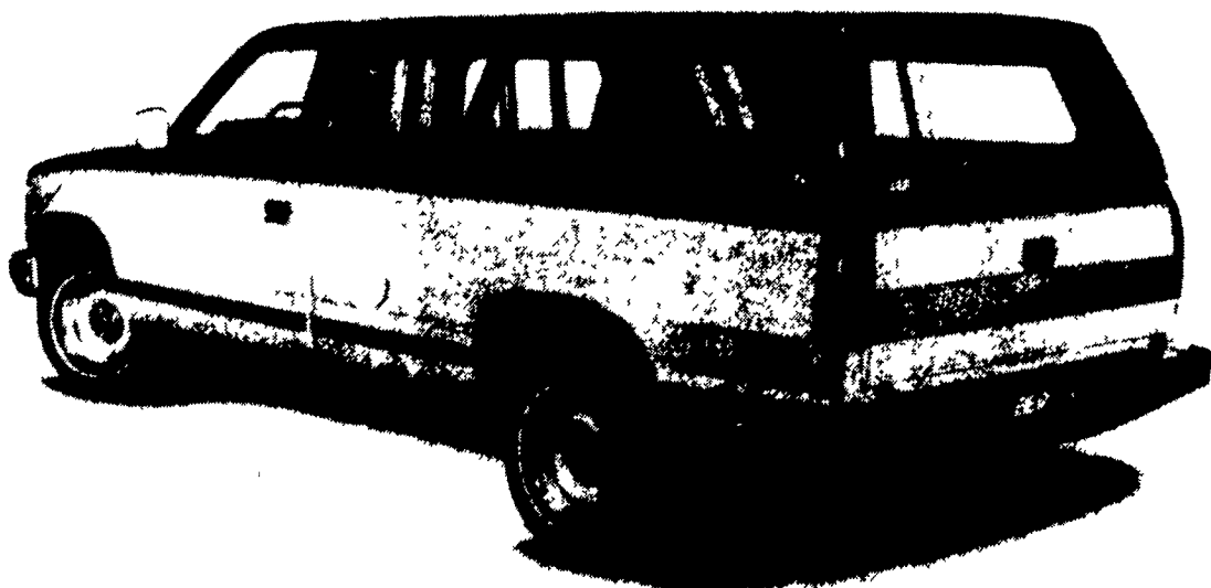
Leer's cap-high Crown 100 cap for full-size trucks has sleek radius slider windows and dual operas for extra style.

made of durable fiberglass and are custom fitted, which means each cap is customized to match the body styling of the truck for which it's designed. Minimal maintenance keeps Leer caps looking fresh and new, mile after mile. Most factory automotive paint colors can be custom-matched and the Crown 100 comes in a choice of two-tone styles, as well.