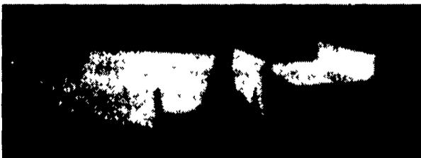
SLANT BACK J BUNK H-BUNK

FACT: Our poured concrete wall reflects 38% of light beams giving 15 times more reflective power than steel. Heat damage occurs when stored feed is heated above 95° F. Our silo protects your feed quality.