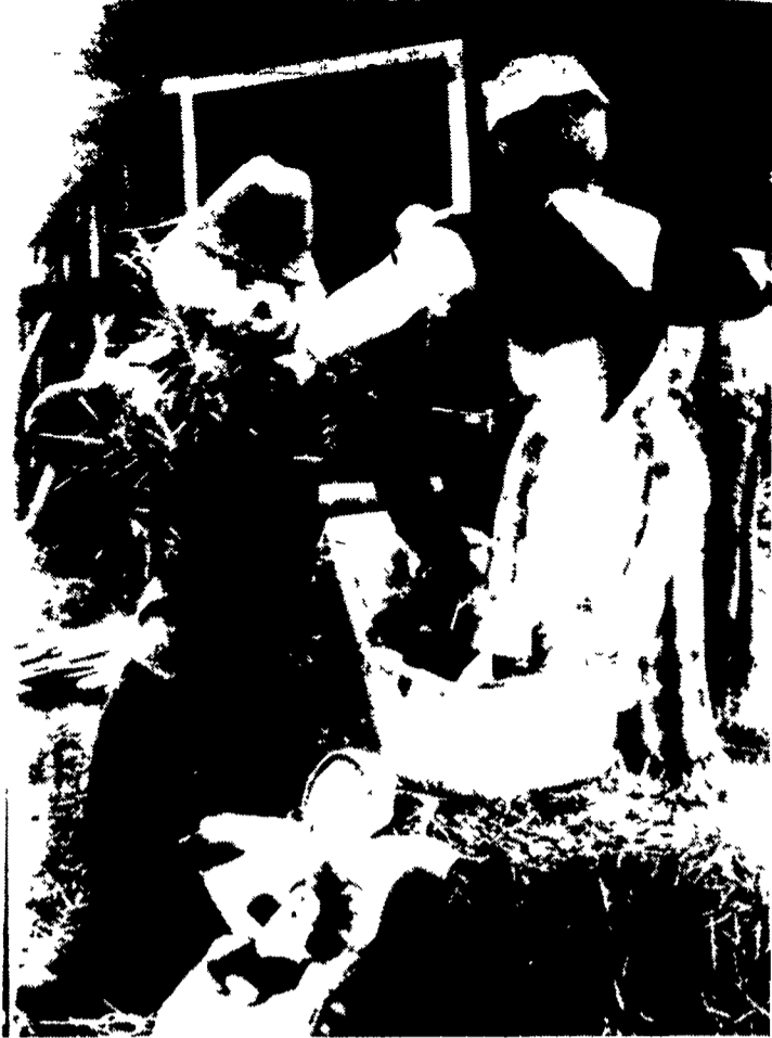
Even scarecrow mommies lug along all sorts of supplies for their babies, including a daddy to help carry it all. A scarecrow baby just wouldn't be comfortable without infant seat, baby blankets, and, of course, throwaway diapers.