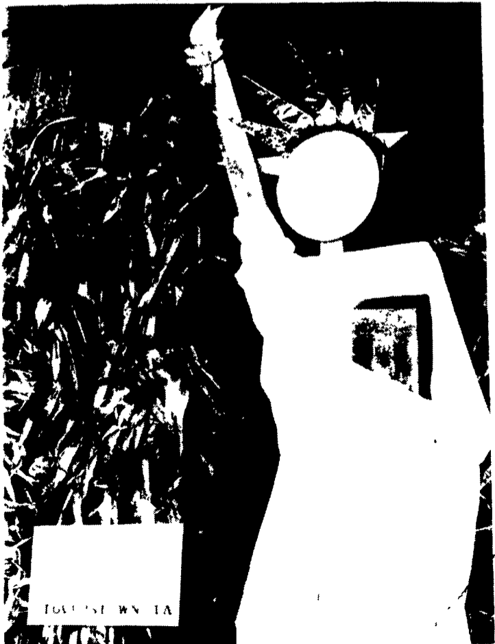
For those wanting a liberated, patriotic look to their garden, there was Miss Liberty scarecrow available.