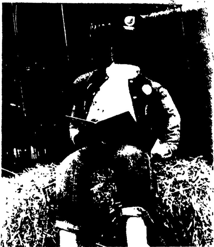
Taking a break from bird watching, this youthful scarecrow props against the RITC farm's bank barn and relaxes with a good book.