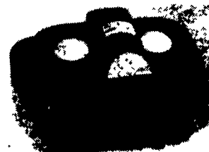
NEW MODEL 3360 23 Gallon Capacity

Year round waterer for all sizes of hogs. Sphere shaped on the underside of lid.