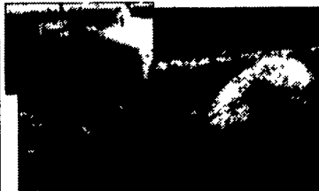
NEW MODEL 3310 6 Gallon Capacity

Year round waterer for all sizes of hogs. Sphere shaped on the underside of lid.