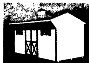
6x12 Salt Box