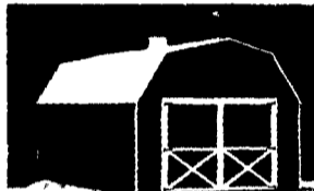
12x20 6' Sides