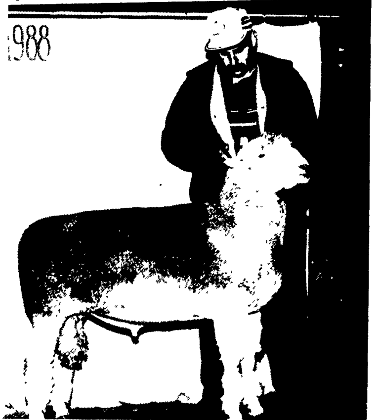
The top two titles of the Corriedale competition at KILE were awarded to a ram and ewe out of the L.D. Cook & Sons flock. Cook, an Ohio native, is shown here with his champion ram.