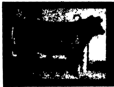
Champion Middleweight 1987 PA Farm Show