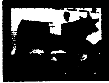
Grand Champion — Bedford Co Fair Reserve Champion — Fayette Co Jackpot Show