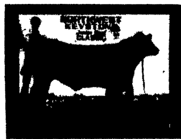
Grand Champion 1987 Northwest Keystone Classic