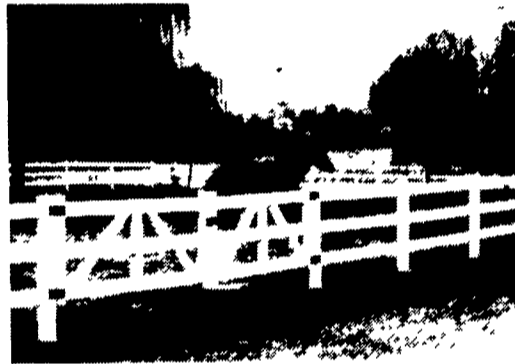
"Vinyl Horse Fence"